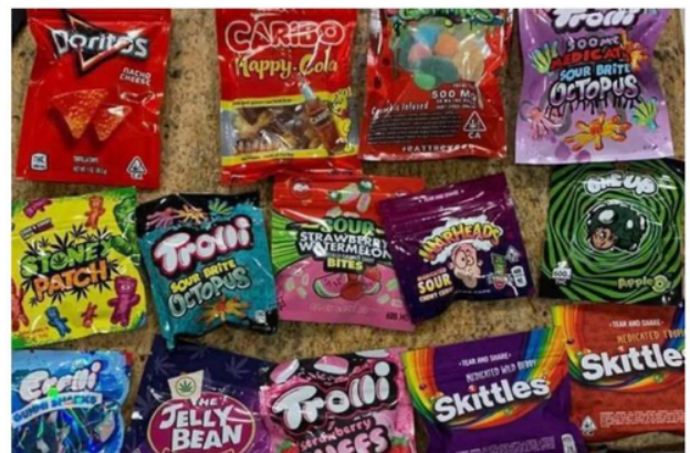
Some of the cannabis sweets uncovered by the investigation