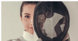
Privacy and Information Security Awareness for Athletes ID: E-0WE430

Athletes are reminded to register for a free account on WADA's Anti-Doping Education & Learning (ADEL) platform via https://adel.wada-ama.org/learn and complete the modules 'National-Level Athletes Education Program', by 30 Dec 2022.