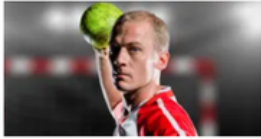
National-Level Athletes Education Program (English)